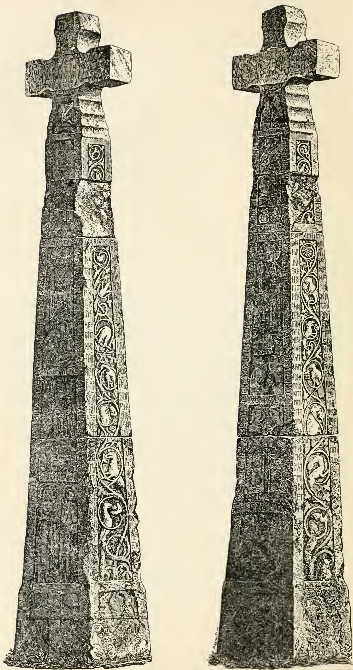
THE RUTHWELL CROSS.