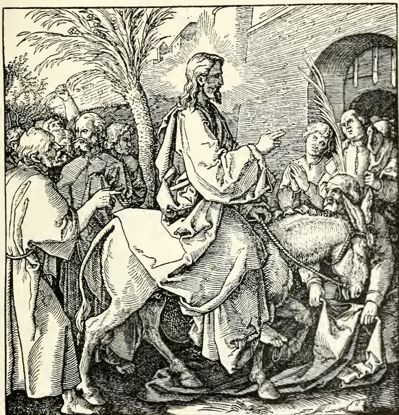
CHRIST'S ENTRY INTO JERUSALEM.

"The picture is divided into two parts dealing with the transfiguration on Mount Tabor and the healing of the demoniac.