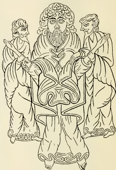
SCENE OF THE MOCKING. From the Book of Kells.

peculiar stare of his large eyes. One might also say that we are here confronted with an anticipation of futurist art.