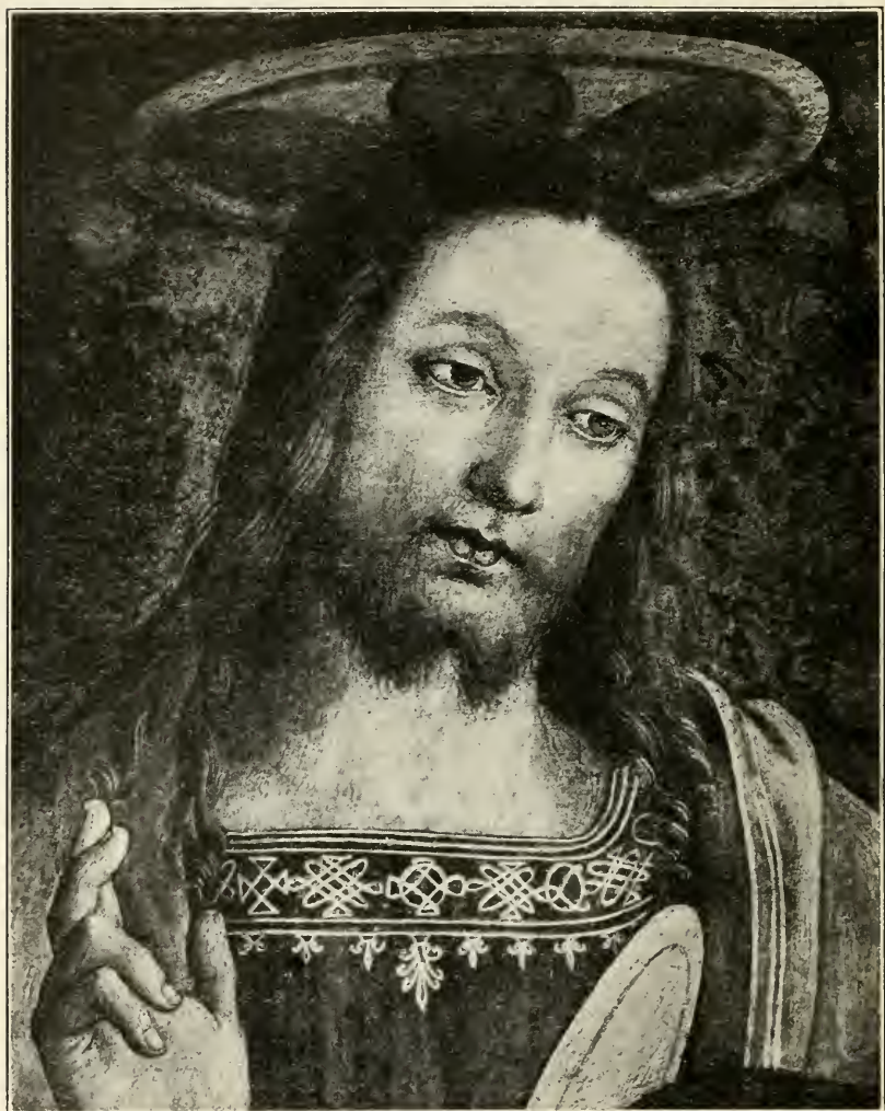
CHRIST IN THE LAST SUPPER.

of this we recall the little story of the first organ that was built in America which the manufacturer offered as a gift to a church in Cambridge, Massachusetts, but the Presbytery indignantly refused it