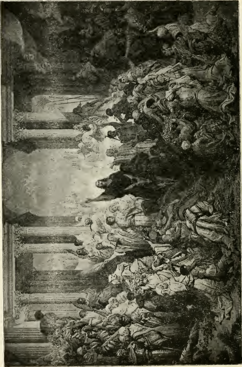
CHRIST'S ENTRY INTO JERUSALEM.

scarcely any Christian artist of note who has deviated from the type or has ever reverted to the youthful beardless Christ figure