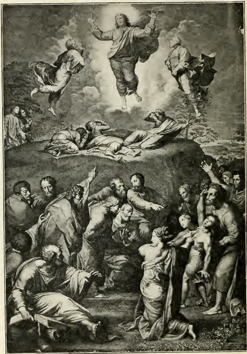
THE TRANSFIGURATION. By Raphael.