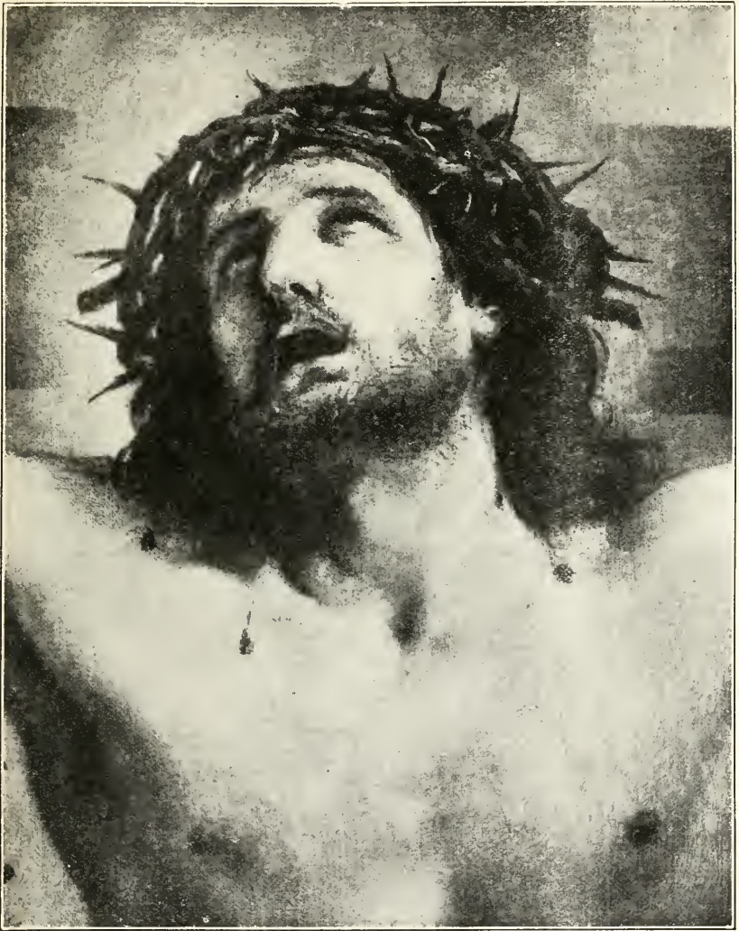
ECCE HOMO. By Guido Reni.

The bearded Christ has been the favorite type since the time