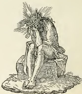
THE MAN OF SORROWS. By Dürer.

mentation of the churches. This found its strongest expression in the movement of the Bilderstürmer , the destroyers of images, against whom Luther rose because he possessed too much common sense to permit such extravagances as they indulged in. This hostility to art showed itself in England in a movement which bred the Puritanism of the Puritans, who after their suppression by the re-