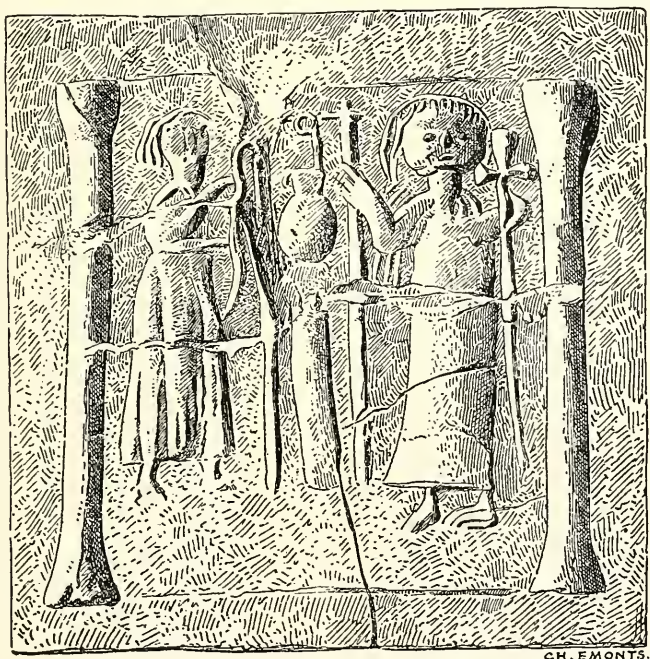
CHRIST AND THE WOMAN OF SAMARIA.

A MONG nations with less developed artistic sense, the portraits of Christ are crude, and show a decided lack of technique, but they are curious and deserve our attention for the sake of the attempt