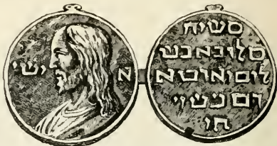
MEDAL OF HEAD OF CHRIST. With Hebrew inscription.

The Reformation was not favorable to art. In fact it contained a strong current resembling the iconoclastic spirit of the early Christians and broke out in violent destructiveness against the orna-