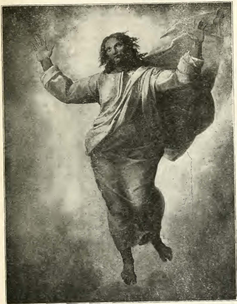
THE TRANSFIGURED CHRIST.

its climax in expressing a fervent devotion and a gratitude towards Christ for his suffering, and so we may regard Dürer's "Man of Sorrows" as representative of the spirit of the Reformation.