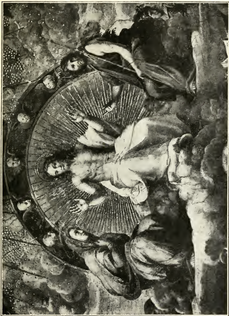
CHRIST IN THE DISPUTA. Detail from Raphael's great fresco.

because he was an unsophisticated child of nature and inherited the traditional Teutonic love of life. At the same time he had a natural taste for music. He was a poet and a composer, and encour-