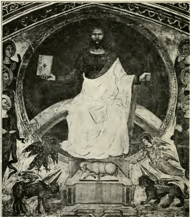
CHRIST IN THE CHURCH TRIUMPHANT.

"The figure of the young woman, kneeling near the demoniac,